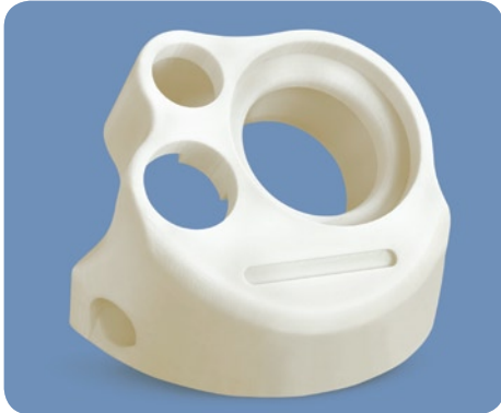
Figure 1: Klockwerks Bezzle