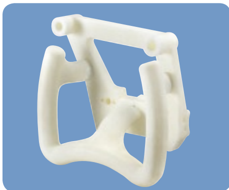
Figure 2: BMW Jig