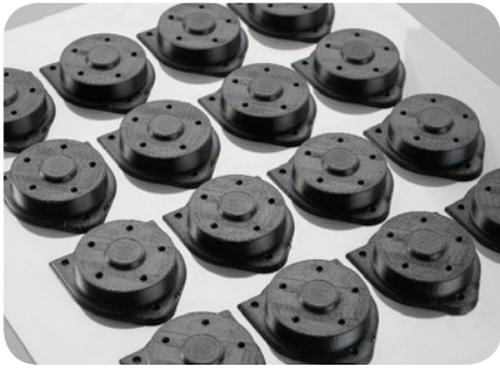
Figure 5: Short-Run Manufacturing

Because there is no tooling, short-run manufacturing principals may be used. This on-demand strategy reduces inventory levels and minimizes losses when product modifications are implemented (figure 5). Also, companies may change the design at any time, and as frequently as desired, so that products remain innovative, optimized and cost effective. Manufacturers no longer face the difficult decision of postponing a desperately needed modification because of lost time and high expense.