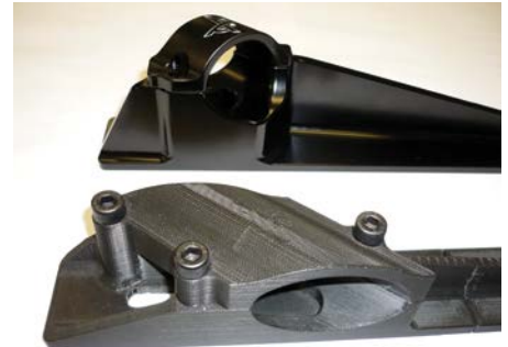
The seat mount prototype compared to the final end-use part.