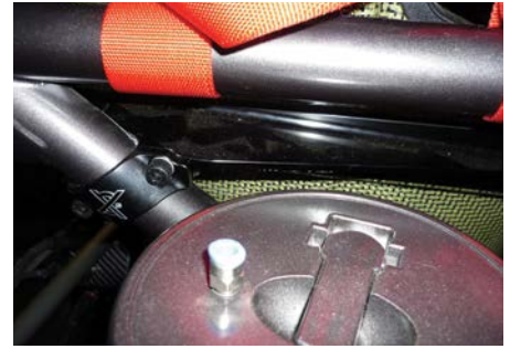
Triple Eight 3D printed the prototype of this seat mount in the racing car.

This strategy is a winning one for Triple Eight Race Engineering now and into the future. They have just beaten the competition at the end of 2014 and retained their championship title for the fourth consecutive year.