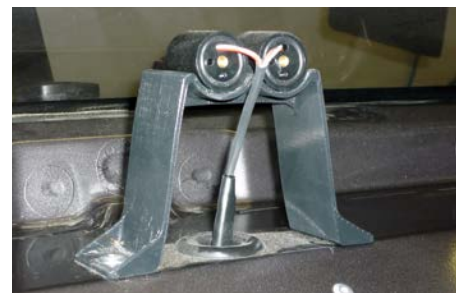
This brake light mount end-use part was also created on the Dimension 3D Printer.