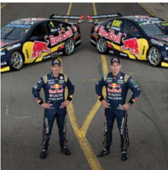
3D printing has helped propel Triple Eight Race Engineering to multiple motor racing championships.

Since its inception in 2003, Triple Eight Race Engineering has grown to become one of the largest and most successful motor racing teams in Australia. The team has dominated the country’s premier motorsport, winning the V8 Supercars Championship six times – an international touring car racing championship that draws crowds of over 150,000 spectators and several million TV viewers. They also won the Bathurst 1000 — Australia’s version of Le Mans — five times.