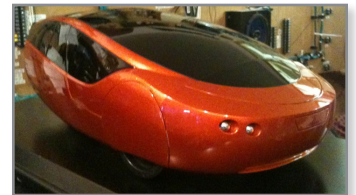
The Urbee is the first prototype car ever to have its entire body 3D printed with an additive process. It was created using Dimension 3D Printers and Fortus 3D Production Systems at RedEye On Demand.