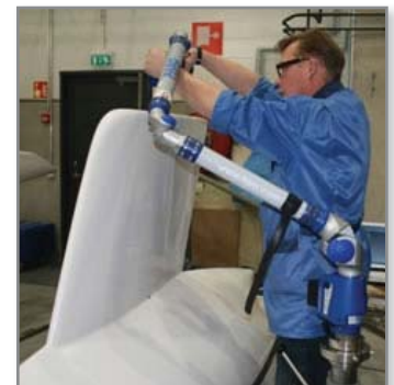
The TDF often reverse engineers components to make the replicas.