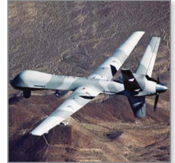
For the Department of Defense, the TDF designs and builds "trainers" and "training aids" such as UAV replicas to train students.

Before settling on FDM, the TDF considered "a multitude" of the other additive processes, says Weatherly. "With FDM, the investment is up front, not ongoing," he says. "The parts are durable, and they have the high level of detail we require. In