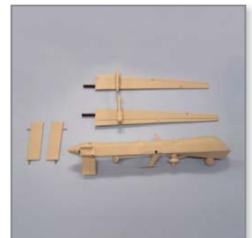
UAV replica fuselage and wings, manufactured with the FDM process.