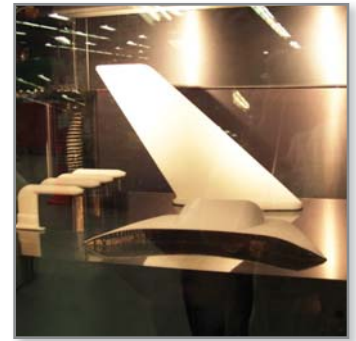
Antenna and other components being manufactured by a Fortus FDM machine.

[Editors' Note: The TDF (Trainer Development Flight) has won the 2008 Air Force Chief of Staff Team Excellence Award for its use of FDM technology and other advanced production methods. It is recognized as the premier center of excellence for manufacturing trainers and training aid products for the Air Force and other required Department of Defense agencies.]