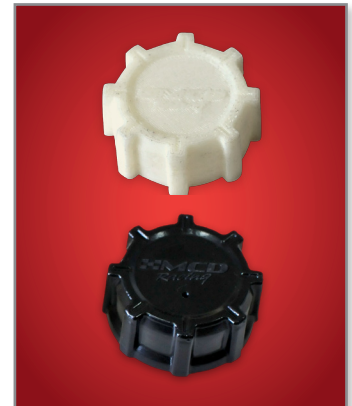
Initial prototype of gas cap (top) and improved prototype with ergonomic feature added (bottom).