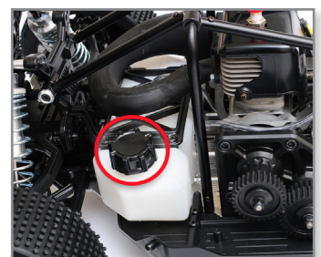
Functional prototype gas cap installed on Race Runner V4.