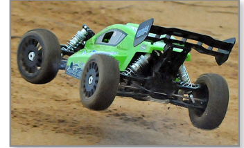
MCD Racing Race Runner V4.